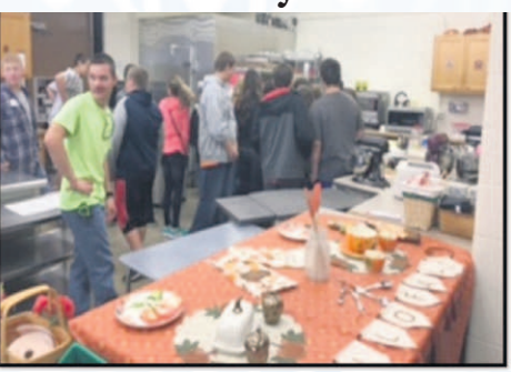
This is HOSPITALITY~! Eighth Grade Students try their hands at food preparation! Knowing all about the best ways to prepare food isn't just for adults! The students assisted in baking bread. Preparing recipes for pleasure brings students back to the table for more! This cake looks delicious, too. There are careers for chefs!